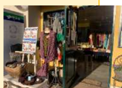
Sales event at Kate Salon ↓

2AMUAMU sale was held at Apple House in Omiya City and Kate Salon in Chihaya Toshima Ward with the following schedule. Sales revenue is expected to rise since the Coronavirus situation has calmed down.