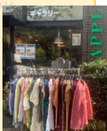
↑ Sales event at Apple House