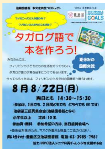
Making books at the Ikebukuro Library→

Children made books in Tagalog on August 8 and 22. Summer heat still lingered but 6 children participated on August 22. Although it was their first experience to make books, they made them very well. The translated books were sent to the Philippines in October.